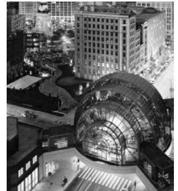
The Arts Garden