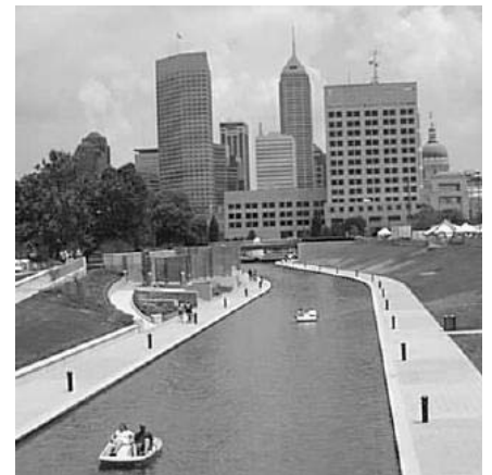
White River State Park Canal

Get your reservations in as early as possible. You'll save money and it is easier for Fred to plan.